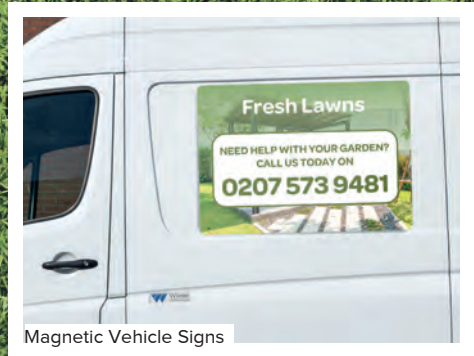
Magnetic Vehicle Signs